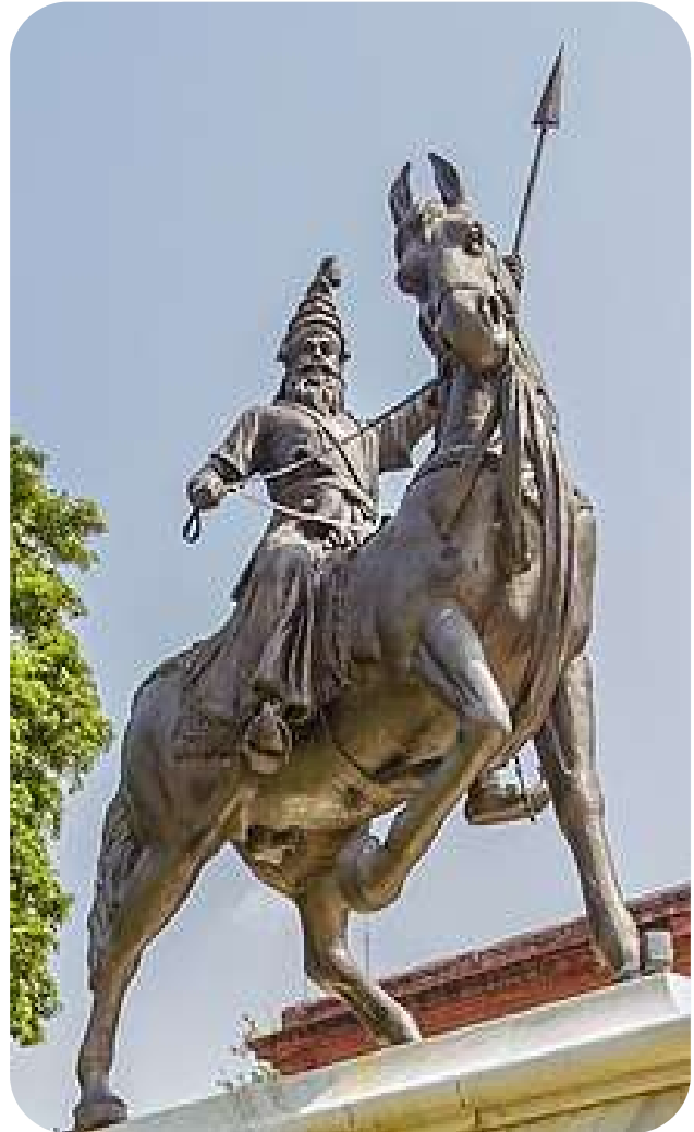
Statue of Akali Phula Singh outside the Partition Museum in Amritsar

to Akali Phula Singh Burj was originally over 13 acres but now that number has been greatly reduced.